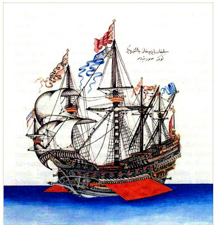
Göke (1495), flagship of Ottoman Admiral Kemal Reis

During his reign, Süleyman turned the Ottoman navy into one of the most powerful in the world. He spent a great deal of money on building new ships, setting up naval bases and hiring skilled captains and sailors. The Ottomans needed a strong navy to protect their trade routes, transport soldiers, guard Muslim pilgrims travelling to Mecca and Medina, and compete with European rivals like the Habsburg Empire, the Knights of St. John and Venice. Süleyman expanded large shipyards in places like Galata and Istanbul, where hundreds of warships were built. He also developed important naval bases in locations such as Gallipoli, Rhodes and Algiers, which helped launch attacks across the Mediterranean. The Ottomans mainly used galleys – long ships powered by rows of oarsmen and armed with cannons. These ships were fast and effective for sea battles and blockades. Süleyman made sure the navy had well-trained sailors, soldiers and rowers from all over the empire. He also set up a professional system to manage pay, supplies and ship repairs.