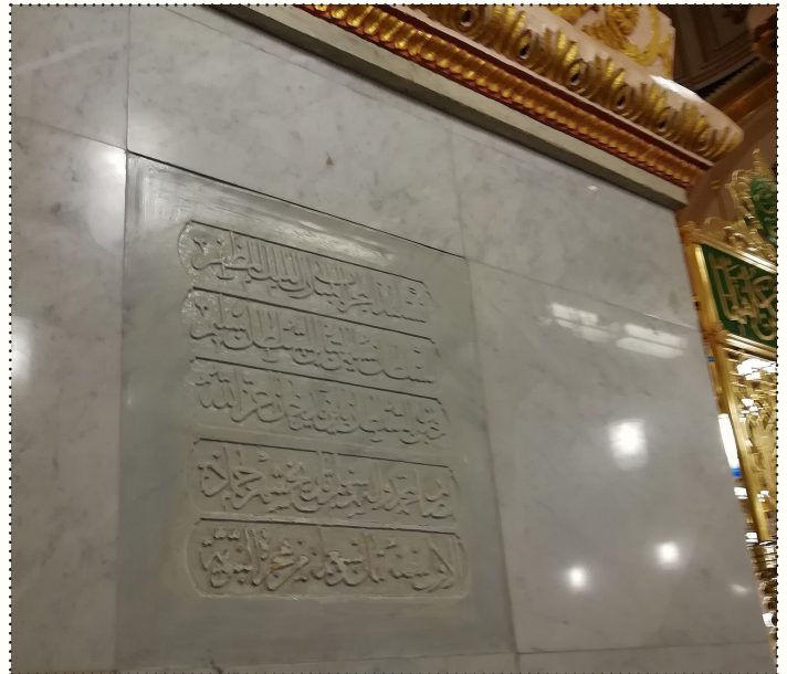
A plate bearing the name of Sultan Süleyman I at al-Masjid al-Nabawi in Medina

Before Süleyman, the empire’s laws were a mix of Sharia (Islamic religious law), kanun (non-religious state law), and örf (local customs). Süleyman worked to bring these together into a clearer, written system so that judges, officials and ordinary people knew what to expect. His law code, called the Kanunname-i Ali Osman , covered taxes, crime, land ownership and how markets should be run.