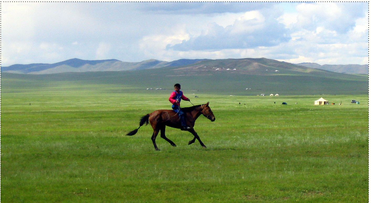
The steppes

The Mongols lived on the vast steppes of Central Asia, a region of grasslands stretching from Mongolia to Eastern Europe. The sheer size of the steppes made communication and transportation difficult. This region experiences extreme temperatures, with scorching summers and bitterly cold winters.