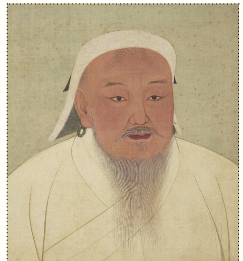
Temujin, Genghis Khan

Following Yesugei's death, Temujin and his mother, Hö'elün, were abandoned by their tribe, who saw them as a liability. They were left to fend for themselves on the harsh Mongolian steppe. Hö'elün's resilience and resourcefulness during this period were a powerful influence on Temujin. This period of exile taught him self-reliance and the importance of survival skills. It also fostered a deep bond with his mother, who became a trusted advisor throughout his life. The hardship they endured together solidified his determination to overcome adversity.