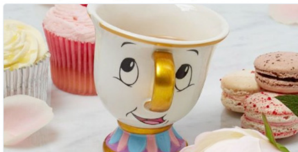
Primark's response to 'Chip gate' is everything

COSMO Cosmopolitan UK @CosmopolitanUK · 45m Primark's response to 'Chip gate' is everything