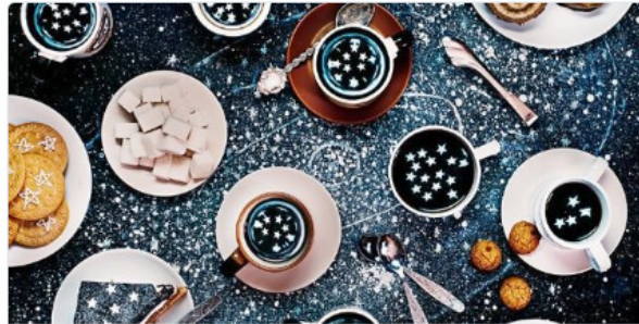
This is the reason why your love life is confusing AF right now

COSMO Cosmopolitan UK @CosmopolitanUK · 28m Is your love life confusing AF right now? Blame Venus in retrograde