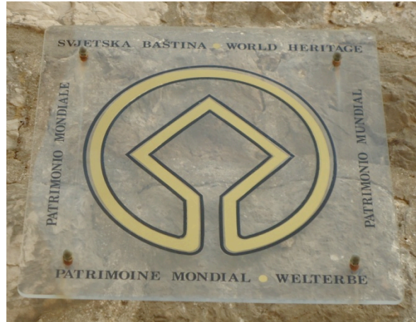
A Signs advertising Dubrovnik's Museums